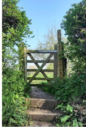
Pic; Footpath gate out/into our orchard