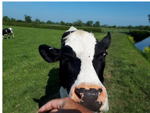
Pic: Friendly folk on route