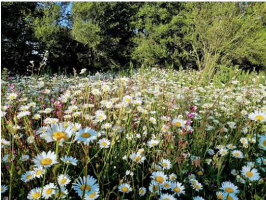
Pic: Section of Wildflowers in our orchard