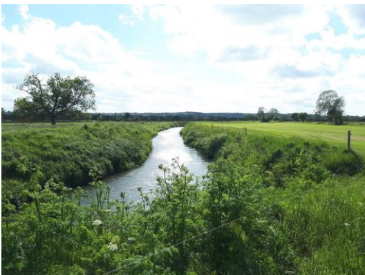
Pic: River Brue