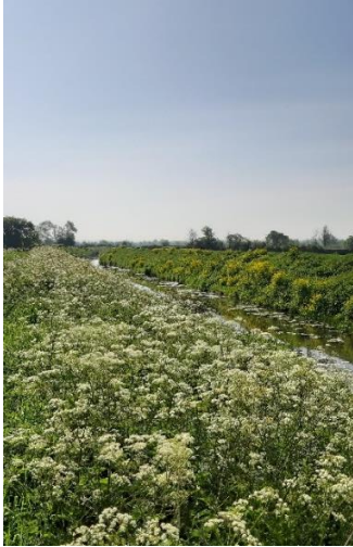
Pic: River Brue