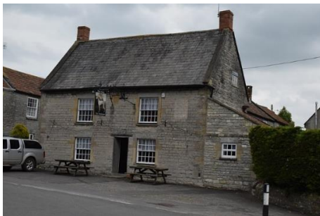
Pic: Greyhound Pub

https://www.facebook.com/pg/balsburygrocer.co.uk/photos/?ref=page_internal