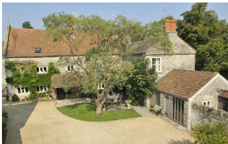
Pic: The Drawing Room

https://whatpub.com/pubs/TAU/165/greyhound-inn-baltonsborough