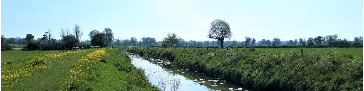
Pic: River Brue