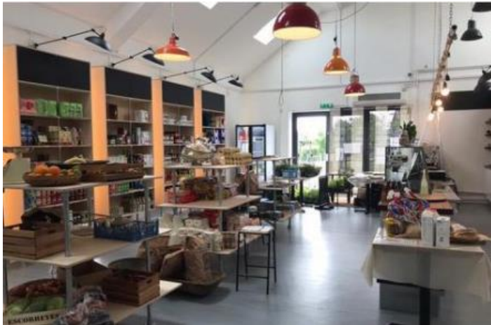
Pic: Balsbury Grocer, Bakers and café

https://www.facebook.com/pg/balsburygrocer.co.uk/photos/?ref=page_internal