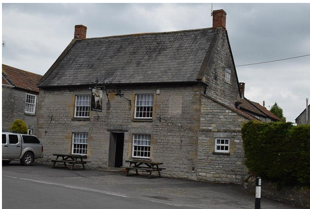
Pic: Greyhound Pub

https://www.facebook.com/pg/balsburygrocer.co.uk/photos/?ref=page_internal