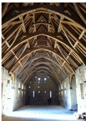
Pic: Pilton Tithe Barn

http://www.tithebarns.co.uk/tithebarnpilton.html