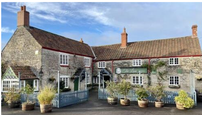
Pic: Red Lion Pub

https://whatpub.com/pubs/TAU/165/greyhound-inn-baltonsborough