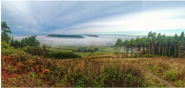
Pic: Coombe Wood