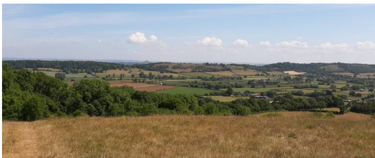
Pic: Lollover Hill Viewpoint

http://www.palden.co.uk/leymap/compton-dundon.html