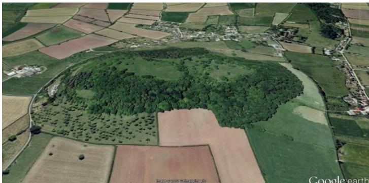
Pic: Compton Hill Fort

http://www.palden.co.uk/leymap/compton-dundon.html