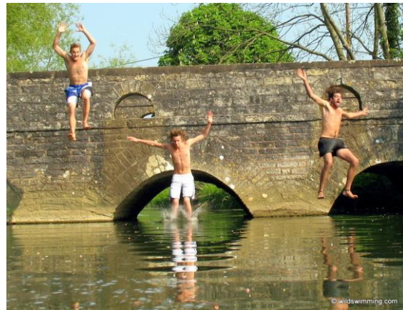
Pic: West Lydford Bridge – some wild swimming https://www.komoot.com/highlight/1556012