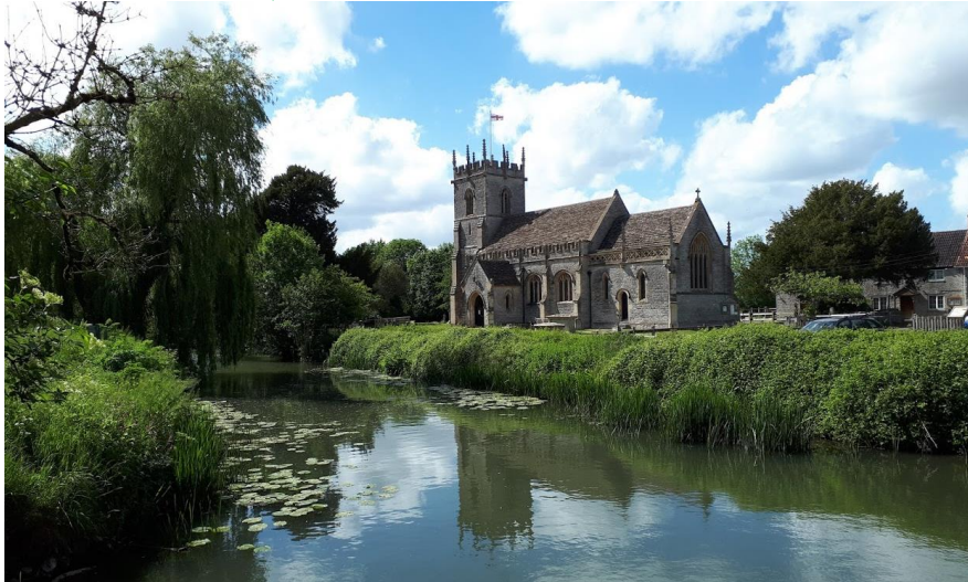
Pic: West Lydford Church