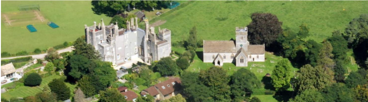
Pic : Butleigh Court and Church

Information: Learn more about the Butleigh History by having the Heritage Trail with you (see Walk 2)