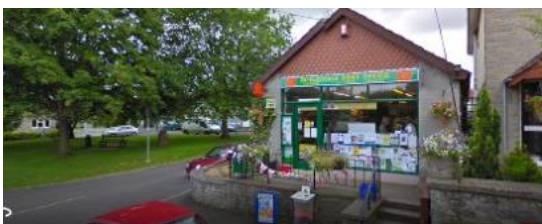
Pic: PO/Shop with Bus stop

https://www.postoffice.co.uk/branch-finder/3055043/butleigh